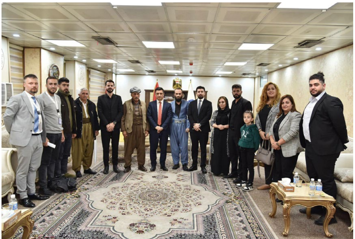
ECBBC delegation meets with Iraqi Minister of Justice in Baghdad on 28 November 2022.

In light of these preoccupying trends, the ECBB campaign is committed to continuing to monitor the military activities of the Iranian forces within Iraqi Kurdistan's territory and borders.