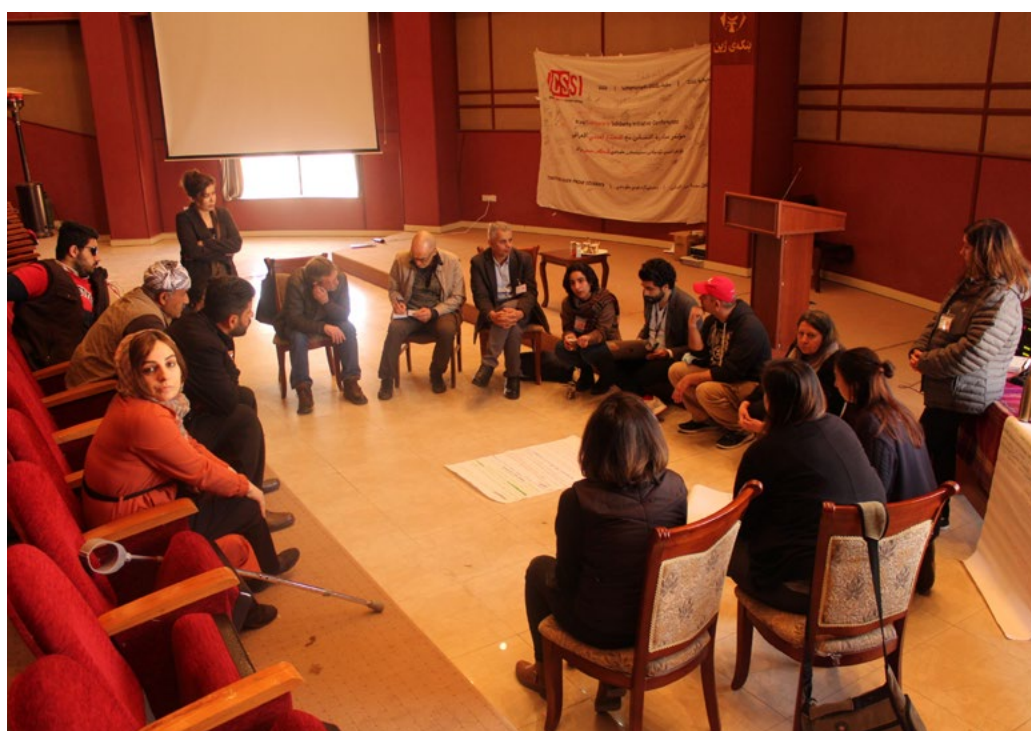
ECBBC strategy planning meeting at the ICSSI conference in March 2022

The casualties dataset (Appendix 1) gives names for the killed, if known, and other demographic and identifying details of the 37 casualties for whom some information in addition to their non-combatant status was available. Names of injured civilians, even when known, have been omitted for privacy reasons. Children are defined as persons 4-17 years old and babies and infants as 0-3.