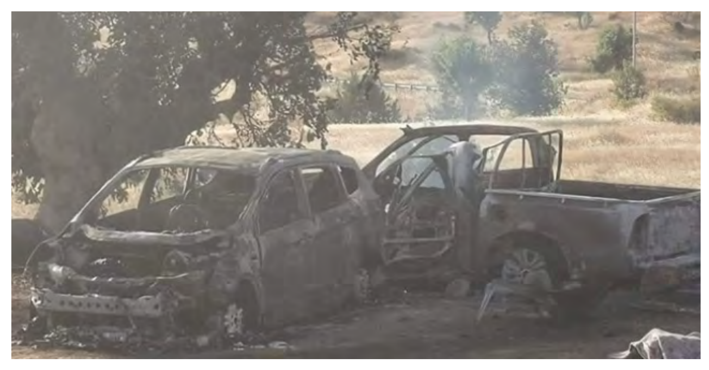
On July 26, 2020, two friends, Dilovan Shahin Omer (a shopkeeper) and Abdullah Ahmed (an off-duty Peshmerga) were killed in a drone strike after stopping by the side of the road to greet each other.

The TAF conducted a number of airstrikes, mainly carried out by drones, inside the Makhmur Refugee Camp, which hosts more than 11,000 people and their descendants who had fled anti-Kurdish violence in Turkey in the 1990s. In four of these airstrikes, 10 people were reported to have been killed and ten others were wounded. However, due to the presence of the PKK in the camp, the civilian status of the seven killed and five injured could not be independently corroborated. The PKK was in the camp to protect residents against ISIS and other armed groups.