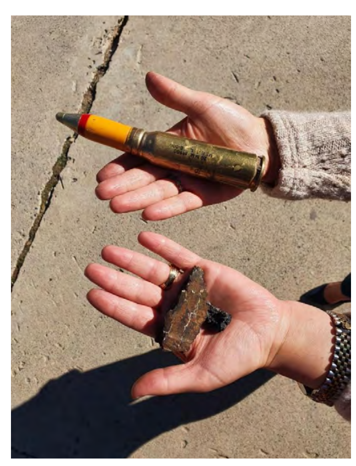
Schoolteacher holds shrapnel and unexploded munition from Turkish attacks on Hirure school. November 2021.