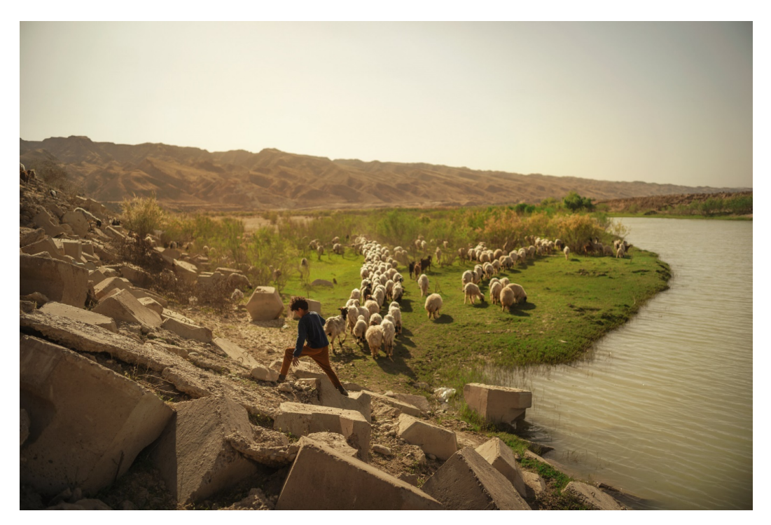
Figure 5. Sheep grazing at the site of the Makhoul Dam. (Source Emily Garthwaite, INSTITUTE 2022).

The rapid population growth globally has further emphasized the need for increased amounts of irrigation water for food production. If the water from the Makhoul Dam reservoir is used for irrigation, it could provide 3 billion cubic meters of water for agriculture downstream.<sup>127</sup> Forty per cent of the world's agricultural production comes from irrigated agricultural land and 50 per cent of all large dams are constructed with the main aim to provide water for irrigation.<sup>128</sup> However, the water gain of these dams usually benefits large-scale economic units such as commercial farms and industries, rather than local farmers, fisheries or local livelihoods. The positive impact of dams also tends to be more advantageous for middle- and upper-class people living in urban settlements, while less so for those living in economically deprived rural areas.