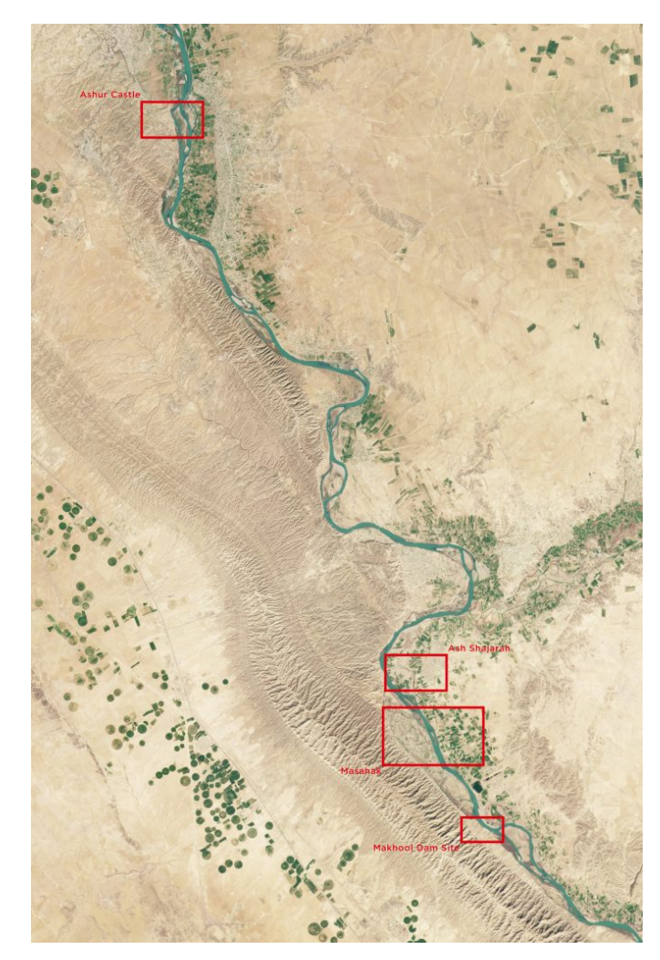
Figure 1. Satellite image of the location of Ashur and the proposed location for the Makhoul Dam, and some of the areas that will be affected.

Securing the water supply, especially under seasons of drought, has further been laid out as the main purpose of the dam.<sup>31</sup> The government has also argued that the dam will support agriculture by providing water for two-thirds of agricultural land in the areas between Baiji, Al-Shirqat, and Al-Hawija districts in Kirkuk.<sup>32</sup> At the same time, flood protection of the districts of Salahaldin and Kirkuk but