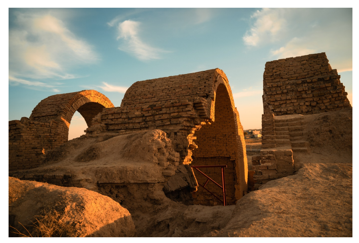
Figure 3. Tabira Gate, part of the World Heritage site of Ashur.

The ruins of the ancient city of Ashur (Qal'at Shirqat), date back to the third millennium BC and has, since 2003, been listed on the UNESCO list of World Heritage. Due to the planned Makhoul Dam, the site is also included in the list of World Heritage in Danger. Located in a unique geo-ecological area,<sup>93</sup> the city of Ashur was a city-state of great importance. It served as the first capital of the Assyrian empire<sup>94</sup> and an international trading platform.<sup>95</sup> It was also the