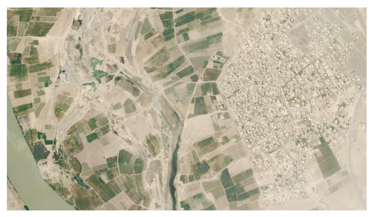
Figure 7. Satellite images of two areas along the Tigris River that will be affected by rising water if the Makhoul dam is constructed.

The implementation of the Makhoul Dam will displace people in three administrative units within Salahaldin and Kirkuk, including the sub-districts of Ashur, Al-Sahl Al-Akhdar, Al-Zawiya, Al-Abbasi and Al-Zab. A study from Liwan